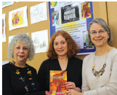
Lasell Cooks/Newton Food Pantry