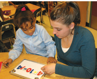
America Reads, America Counts

In addition to these significant partnerships with area community organizations, Lasell students also participated in several one-time community service events for a total of 1,701 hours involving 547 student attendees over the last academic year.