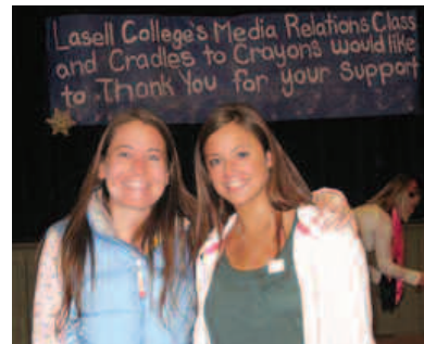
Cradles to Crayons